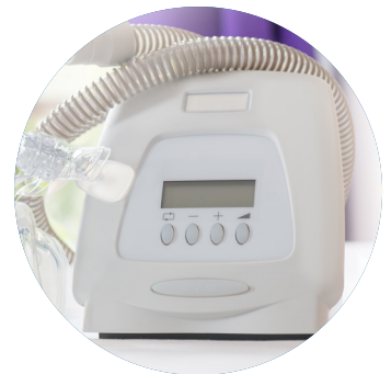
Sleep Apnea Therapy